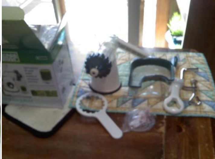
Cost Aed 300